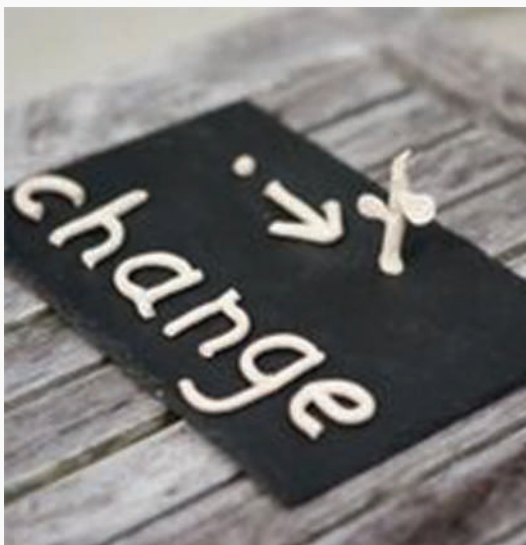
Change in real life

Working through math using clay is engaging and powerful, but most math will need to be done with paper and pen! Rest assured, you'll be amazed to find yourself easily solving complex arithmetic problems on paper before the end of your program - and have solid techniques to address word-based story problems.